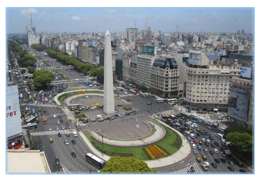
This Buenos Aires monument is called an obelisk . It sits in the middle of the widest street in the world.

Known for its friendly people, Buenos Aires is home to many people from Europe and the rest of the world. As a result, Buenos Aires is also the most European-looking capital city in South America.