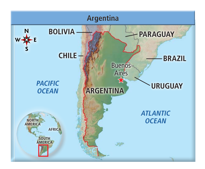
Where Is It?

Argentina is the second-largest country in South America and the eighth-largest country in the world. Its land covers 2,736,690 square kilometers (1,056,642 sq. mi.). Argentina lies between the Andes Mountains, the longest mountain chain on Earth, and the Atlantic Ocean. The countries of Brazil, Uruguay, Paraguay, Bolivia, and Chile border Argentina.