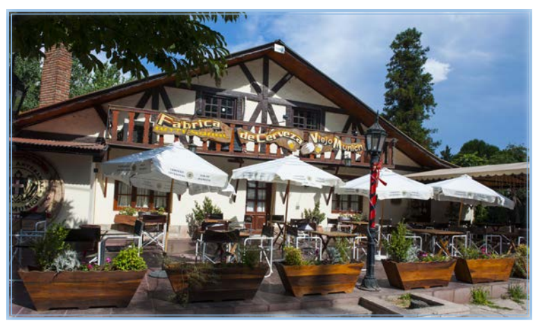
European-style buildings can be seen in Villa General Belgrano, a district in the province of Córdoba.

The main language of Argentina is Spanish. However, since most people in Argentina have family members from different countries, some people speak other languages as well.