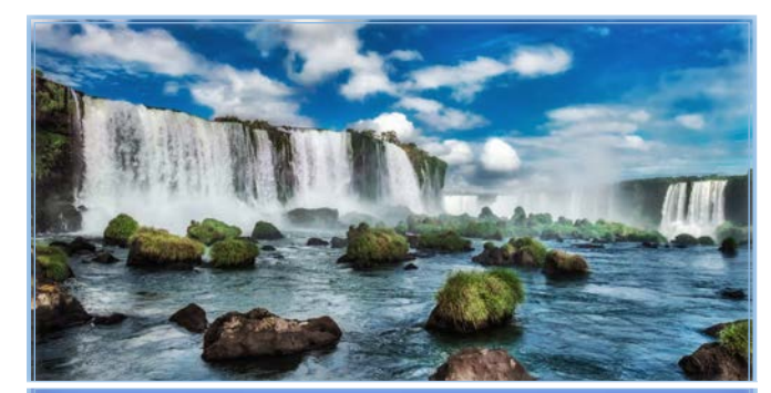
Iguazú Falls are one of the seven natural wonders of the world.

Mount Aconcagua, in the Andes, is the highest mountain peak in the Americas.